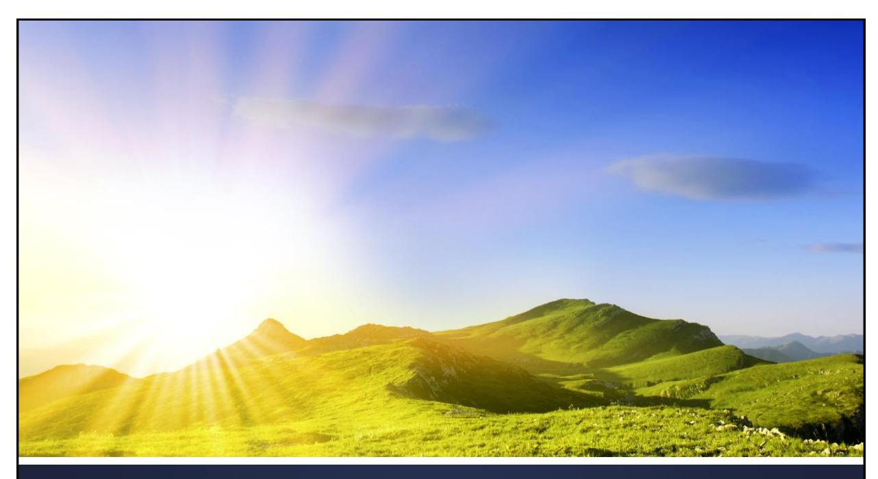
Esteeming His Name Going Forth and Leaping